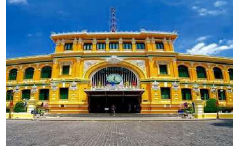
The Centre Post Office