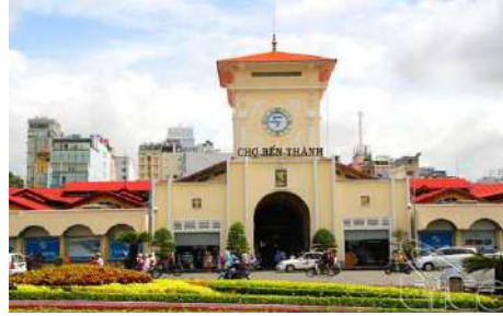
Ben Thanh Market