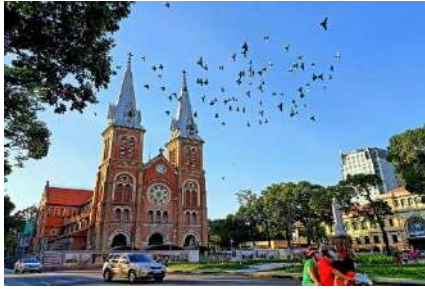
The Hundred Years Red Cathedral